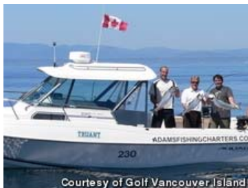
Fishing charters run right out of Victoria's harbor on Vancouver Island.

Painter's Lodge is fishing's version of Pebble Beach . Not that they're going to put on any airs. One of the best things about