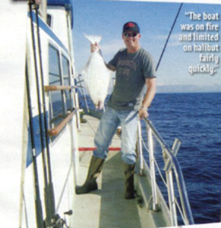
"The boat was on fire and limited on halibut fairly quickly."