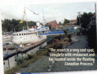
"The resort is a very cool spot, complete with restaurant and bar located inside the floating Canadian Princess ."

Shot of son hugging trout wins Oregon angler fishing adventure aboard Canadian Princess .